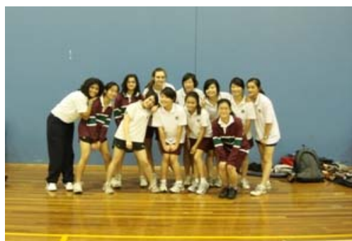
The Intermediate Girls Badminton team 2008