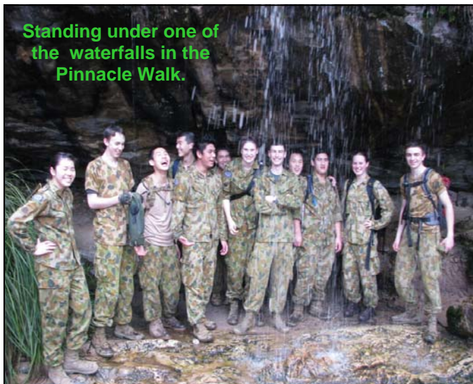
Standing under one of the waterfalls in the Pinnacle Walk.